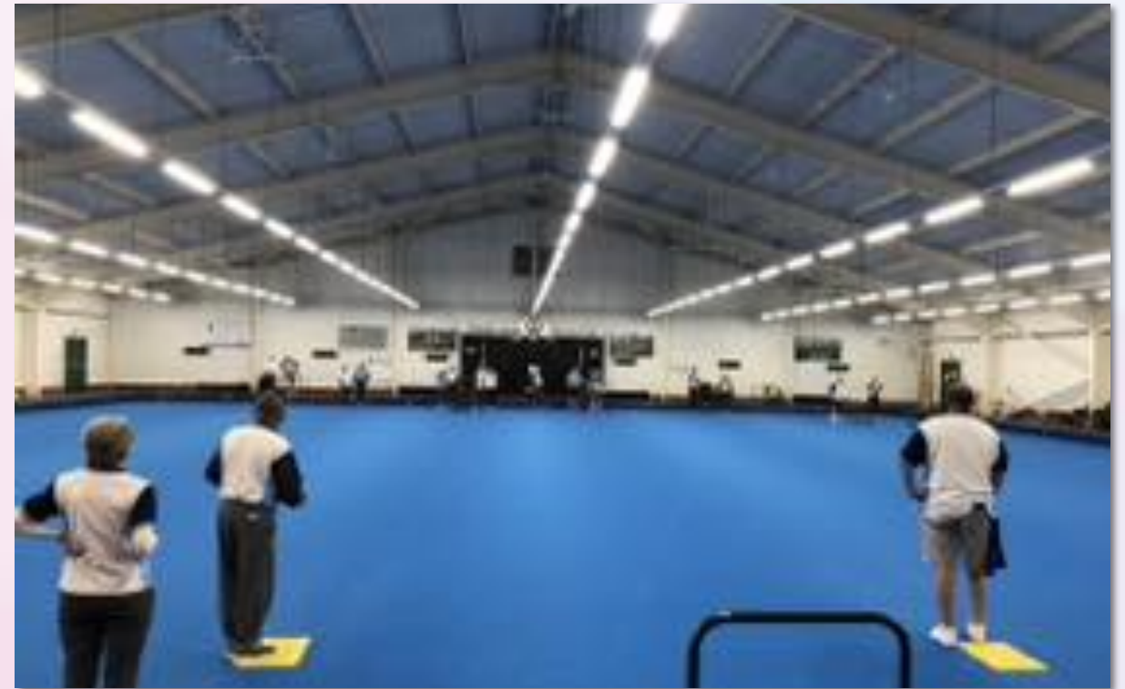
TDBC members enjoying friendlies and competition games in the amazing six rinked indoor bowling facility at Taunton Deane.